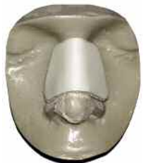
5- Aluminum Splint