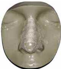
2- Protecto Tape