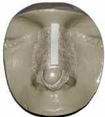
3- Dorsal Pad