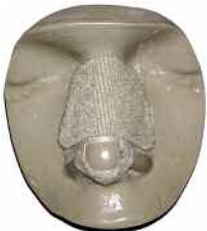
4- Adhesive Velcro