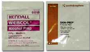
1- Alcohol and Skin Prep